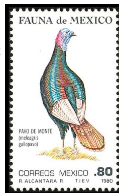
Ocellated Turkey on a Stamp of Mexico

A turkey, originally painted by John James Audubon appears on this Cinderella (not valid for postage) stamp printed by the pseudo government of exiled Haitian ex-president Jean-Claude "Baby Doc" Duvalier.