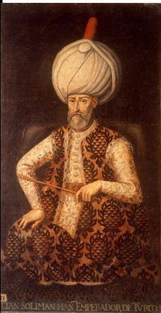
An Ottoman Sultan

A story I have heard is that the bird's striking feathers and tail remind some of what they thought Turkish sultans looked like in their royal finery.